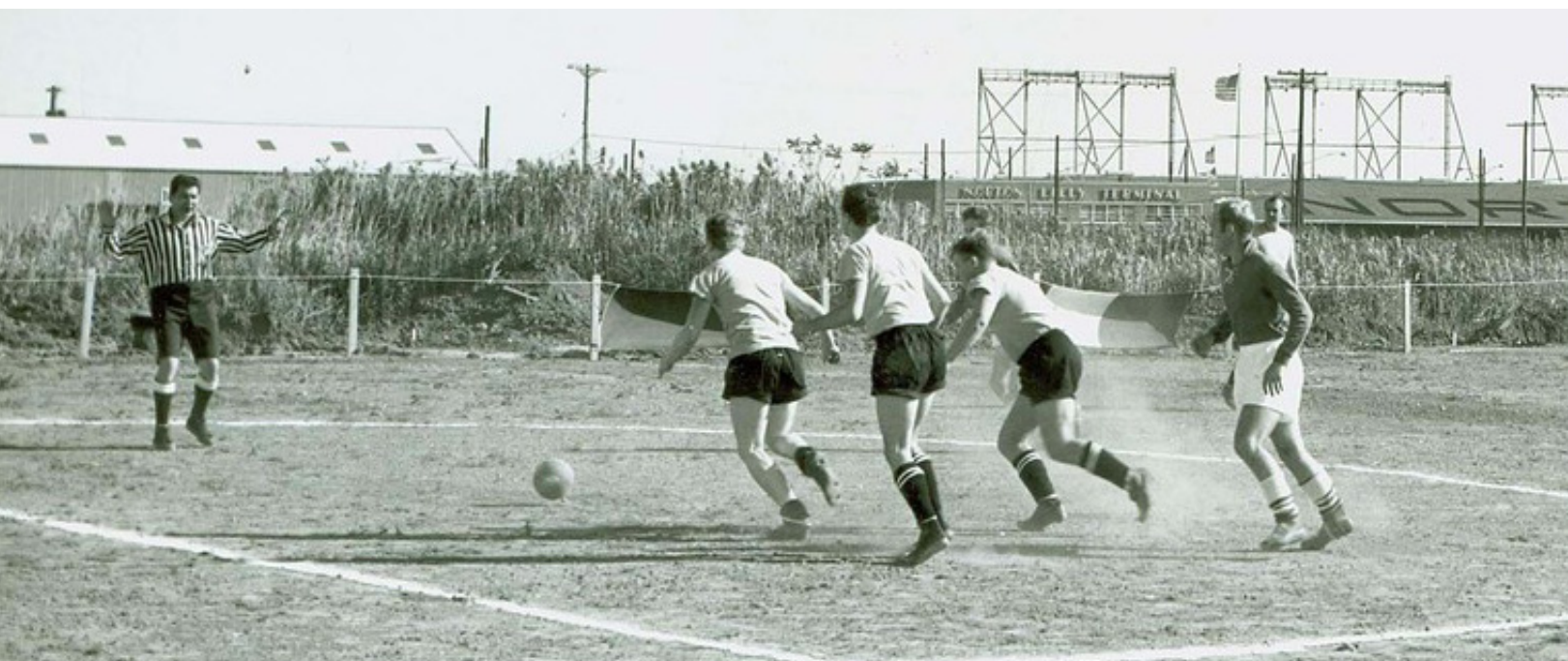
Soccer Games at Port Newark Seafarers' Center Sports Field (1960s)

The physical and mental wellness that mariners get from athletic competition is no less important today than it was a century ago, but the short turnaround times of modern shipping pose a challenge to any kind of shore leave. Seafarers often have gym facilities aboard ship, but port workers make use of our fitness center at the International Seafarers' Center in Port Newark. Today, SCI's soccer field is a green oasis in the midst of the dust and bustle of Port Newark and a reminder of our commitment to mariners' physical well-being.