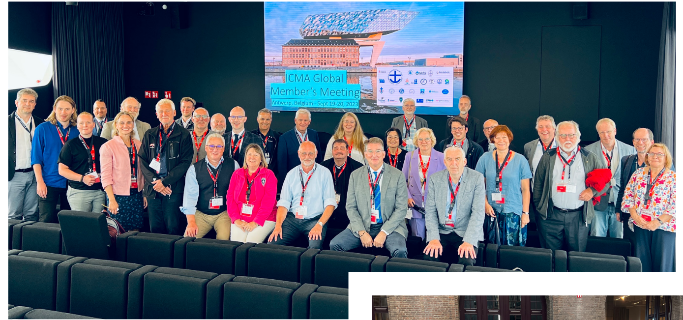
Above: Leadership and representatives from the 27 organizations that constitute ICMA's membership, gathered for the 2023 AGM in Antwerp.

As an organization, ICMA was founded to facilitate ecumenical partnerships among the many Christian organizations around the globe that are involved in maritime ministry and chaplaincy. At its first meeting, which was held in Rotterdam in 1969, over 100 delegates representing 52 organizations gathered to discuss both the changing face of maritime ministry and the need to work collaboratively. While now an international organization headquartered in London, ICMA's founding and roots can be traced to the U.S. and to the body now known as NAMMA, or the North American Maritime Ministry Association. The Seamen's Church Institute (SCI) was instrumental in calling together the many separate entities that ministered to seafarers in the United States and Canada, beginning in 1897 with an event hosted by SCI in lower Manhattan, which met again in 1910 and 1930. The National Association of Seamen's Agencies became an official body in 1932. Several name changes later, this agency is now known as NAMMA.