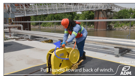
Together with Mike Martin Media based in St. Louis, CME is creating a video library of basic towboat training modules for ARTCo. Here's a collection of stills from the program on "Operating a Winch."