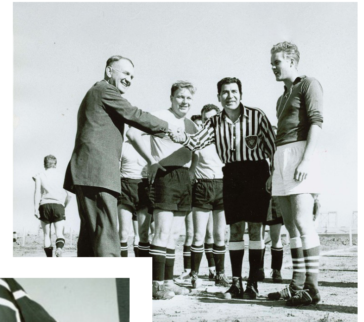
Norwegians coordinated with SCI to sponsor an international sports week in the 1970s and 1980s.

When SCI announced plans to open a center at Newark, its primary function was as a recreation center. The center, dedicated in June 1961, featured a snack bar, lounge, dressing rooms, and a soccer field where the Ciudad de Pasto team of the Grand Colombiana Line tied the Meyer Line's Havhok team 1-1 following the ceremony. Renovations and expansions would pause soccer and track and field competition. The