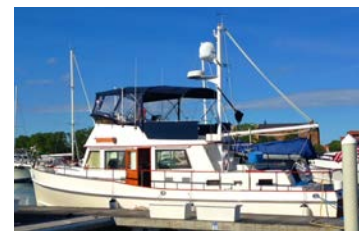
"Knot Our Problem"